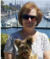
Publications Susan Newland